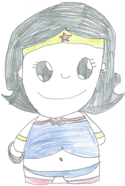
By Summer Gorringe