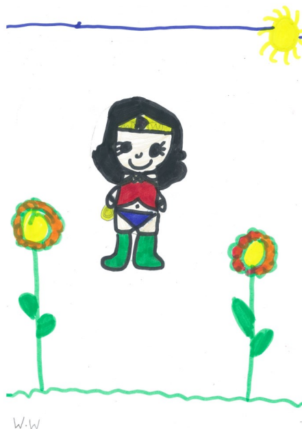
By Chelsea Copeland