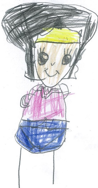
By Amahlia Nott