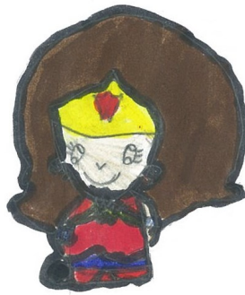
By Jade Clements