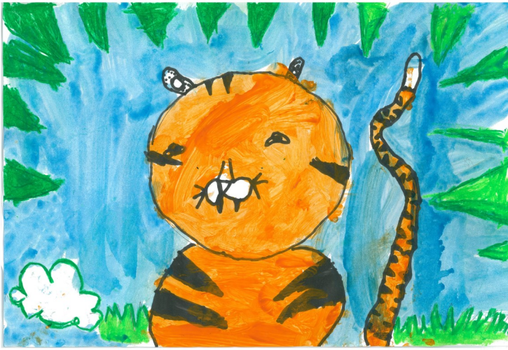
Crouching slowly through the long grass the tigress sees a deer. By Natalia Roberts