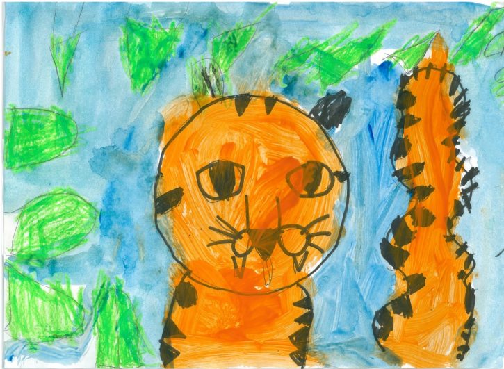
A tiger is crawling slowly in the long grass.