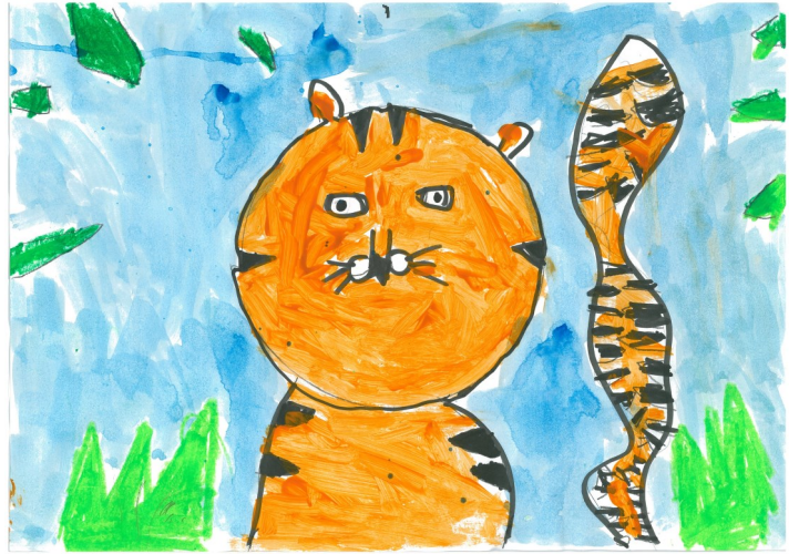
A tiger quietly hunting in the long grass.