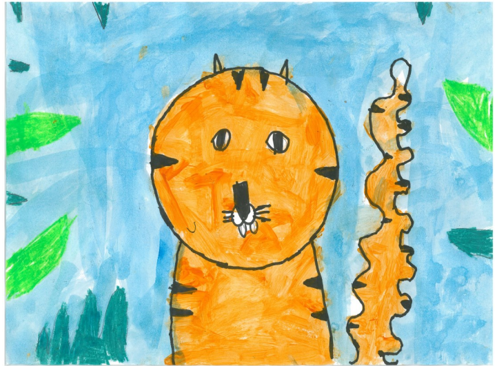
A tiger is creeping quietly in the long grass.