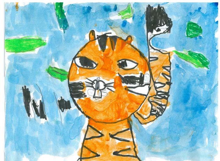
A tiger is prowling softly in the long grass.