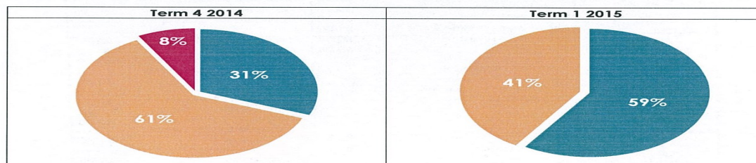
Table 1. Canteen menu progress

Congratulations! Based on your current canteen menu, you are meeting the Fresh Tastes @ School NSW Healthy School Canteen Strategy!