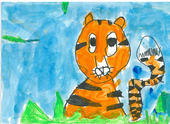
A tiger is prowling softly in the long grass. By Kadence Carr