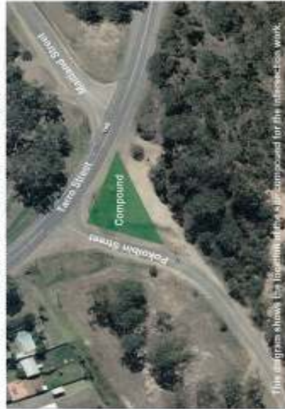
This map shows the location of the site compound for the permanent work.

A minor site compound will be set up on the corner of Pokolbin Street and Tarro Street and will include a site office with lunchrooms, car parking facilities, storage facilities, small stockpile areas and construction vehicle access from Pokolbin Street. The site compound will also be fenced. The map below shows the location of the compound.