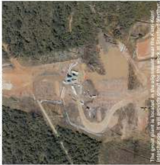
The grout plant is located in the alignment east of the Kurri Kurri Interchange. It will provide grout for this work at Stanford Merthyr.

The grout will be transported via agitator trucks that will come from the grouting plant located on the Hunter Expressway alignment to the east of the Kurri Kurri interchange (shown in the photo below). The agitator trucks will travel along Main Road/Lang Street, turn left at the roundabout onto Victoria/Tarro Street and right into Pokolbin Street to access the site compound. Trucks will turn into Matland Street when grouting work is being done on the Stanford Merthyr side of the intersection.